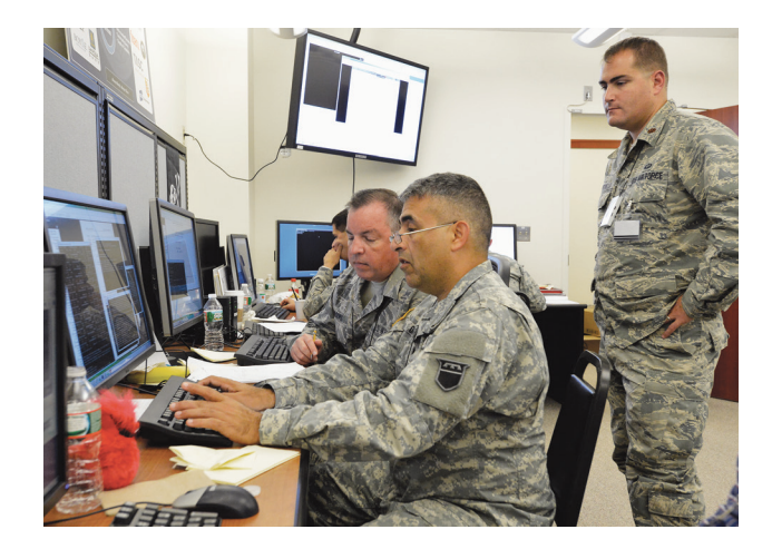
FIGURE 1. During a red/blue exercise held at Lincoln Laboratory, members of the blue team look through data gathered by their defensive tools to tease out signatures of network attackers—both LARIAT virtual users and members of the live red team. The network defenders are from different Cyber Protection Teams, which are being created by the U.S. Cyber Command to help companies and government agencies defend their networks from cyber attacks.

Many uses of cyber ranges involve testing offensive and defensive tools, or running red-on-blue exercises (Figure 1). Adversarial traffic is absolutely essential for creating a realistic environment for these events. This traffic is used not only as a cover for live red teams to help assess the stealth of their teams or their tools but also as a base level of attacks that the defensive tools must