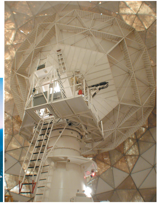
The sixty-eight-foot-diameter ALCOR radome, shown on the left, houses the forty-eight-foot-diameter antenna and its pedestal. ALCOR, which became operational at Kwajalein Atoll in 1970, was the first high-power, long-range, wideband field radar.

The prospect of such a radar was viewed by some as a very highrisk venture. They argued that one would have difficulty generating and amplifying this wideband pulse with its 500 MHz of instantaneous bandwidth. Some thought the atmosphere might disperse the signal, and all argued that tracking with such resolution and processing the returns would be a daunting task.